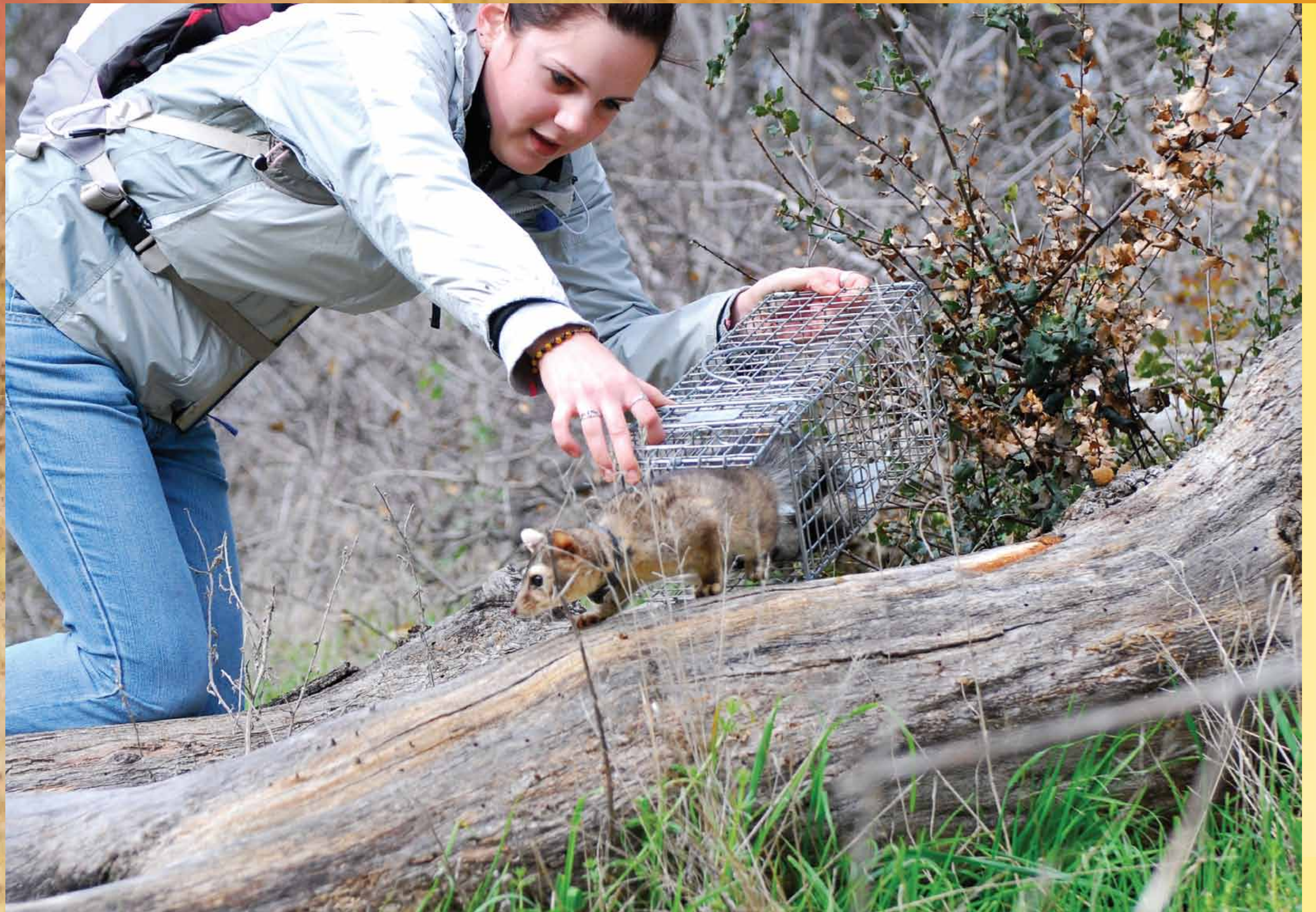
Biology Research, Sutter Buttes